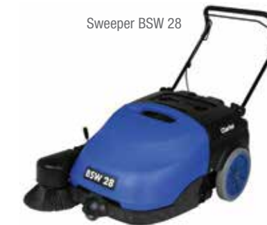
Sweeper BSW 28