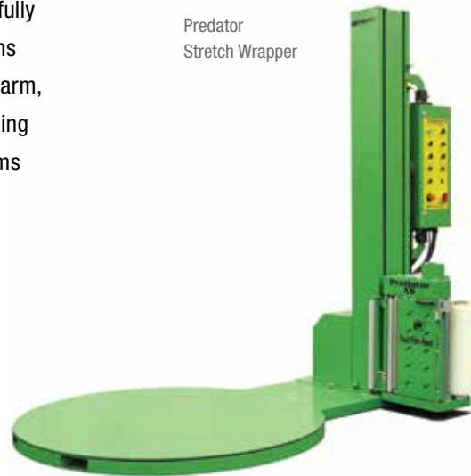
Predator Stretch Wrapper