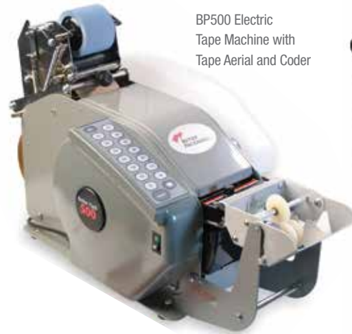
BP500 Electric Tape Machine with Tape Aerial and Coder