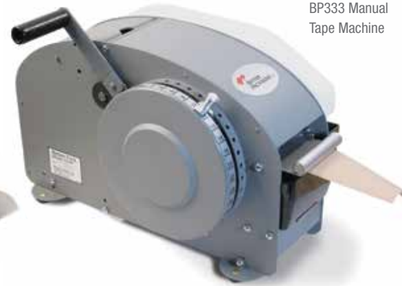
BP333 Manual Tape Machine