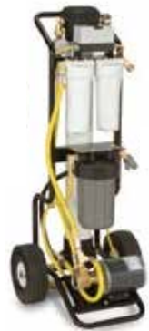
Rodi Window Cleaning System