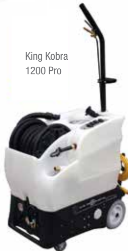
King Kobra 1200 Pro