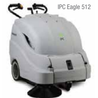
IPC Eagle 512