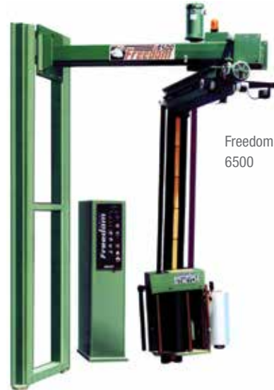
Freedom Swing 6500