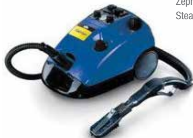
Zephyre Steam Cleaner