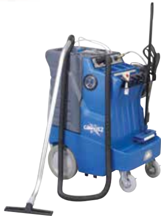
All Surface Compass Cleaner